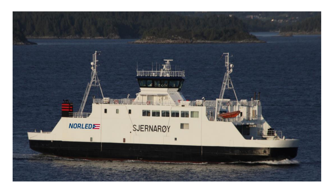
Passenger & car ferry